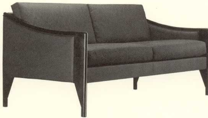
1802 Phoenix Sofa

Fully upholstered cherry wood frame chair. Loose seat and back cushions. Available in a variety of wood finishes and upholstery combinations. 28" H 31½" D 26" W Seat Height: 17½"