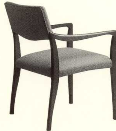
3801 Phoenix Pull-Up Chair

Carved wood frame arm chair. Cherry frame with upholstered seat and back. 33" H 24" D 22½" W Arm Height : 25" Seat Height: 18½"