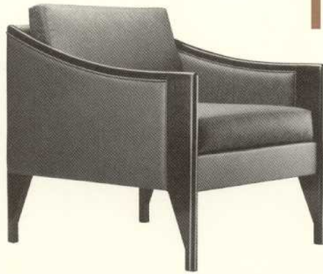
1801 Phoenix Lounge Chair

Fully upholstered cherry wood frame chair. Loose seat and back cushions. Available in a variety of wood finishes and upholstery combinations. 28" H 31½" D 26" W Seat Height: 17½"